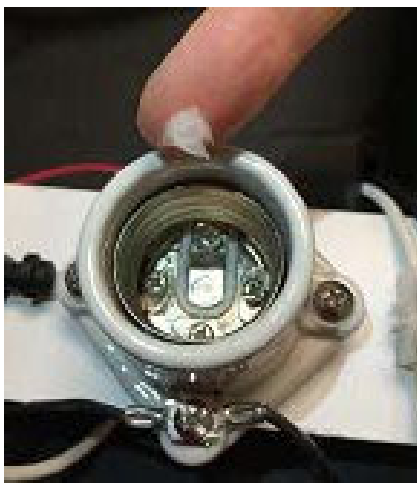
Figure 2, adding dielectric grease to sockets