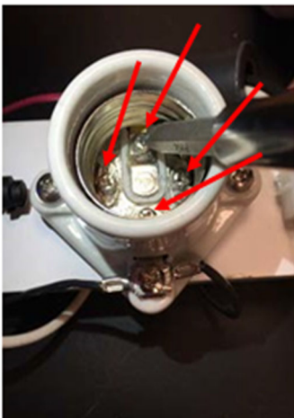
Figure 1, tightening the 4 socket screws

Replace the lamps and ensure they are firmly tightened into their sockets.